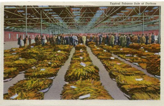
Postcard of Typical Tobacco Sale at Durham

Despite the diversions outside the warehouse, the auction was the main event and dominated the downtown scene. This was the time when the anxious farmer would find out what he would be paid for the culmination of his year of hard work. Tobacco auctions were more than just a sale – they were exciting, festive affairs. With the tobacco lined up row by row in the warehouses, warehousemen, buyers, sellers, speculators and the auctioneers, would crowd around to observe and/or participate in the fast paced bidding.