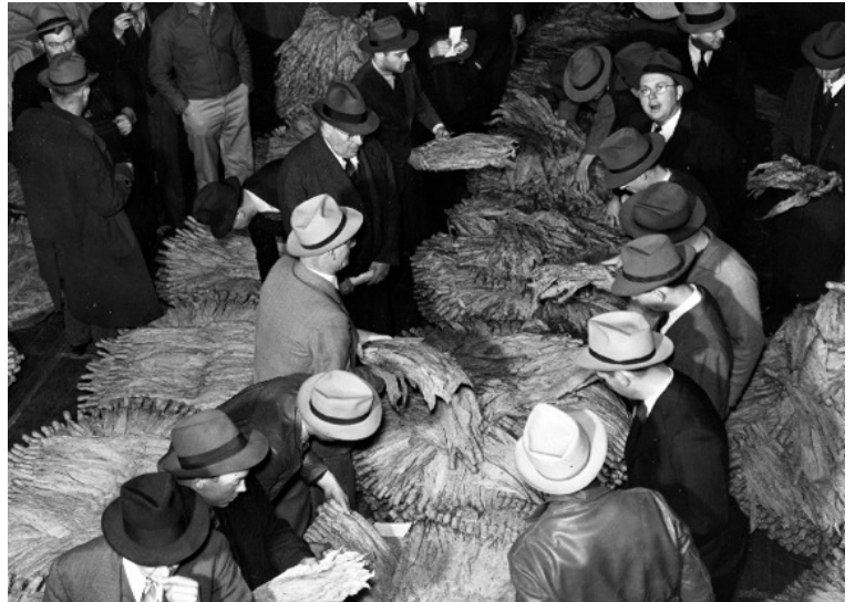
Auctioneer, buyers, and farmers during tobacco auction Durham, NC, 1939."

Auctioneers needed incredible skill and focus. The faster the auctioneer could chant, the faster the tobacco would be sold. While chanting out prices, the auctioneer had to also intently watch buyers' body language. Particular signals (a slight hand gesture, a nod, etc.), often small and secretive since buyers didn't want others to know who was bidding, meant that the person agreed to the price. The auctioneer's job was to quickly raise the price to see if anyone would bid higher. If not, the auctioneer would yell out "Sold!" and move on to the next pile of tobacco, beginning the process again. Other warehouse staff, such as ticket markers, bookmen and clipmen would record prices, pounds purchased, buyers names, etc.